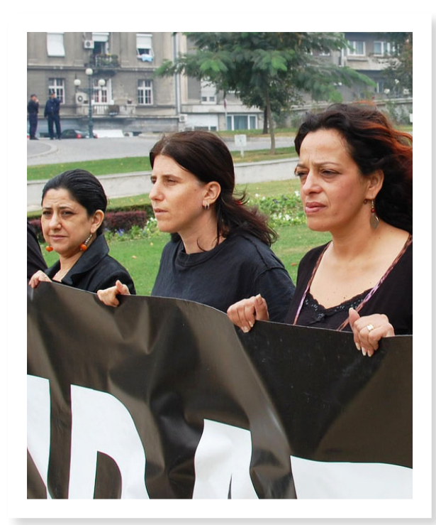
Many women's organisations organise actions to communicate their messages. The picture shows a manifestation in Belgrade in memory of the genocide in Srebrenica.