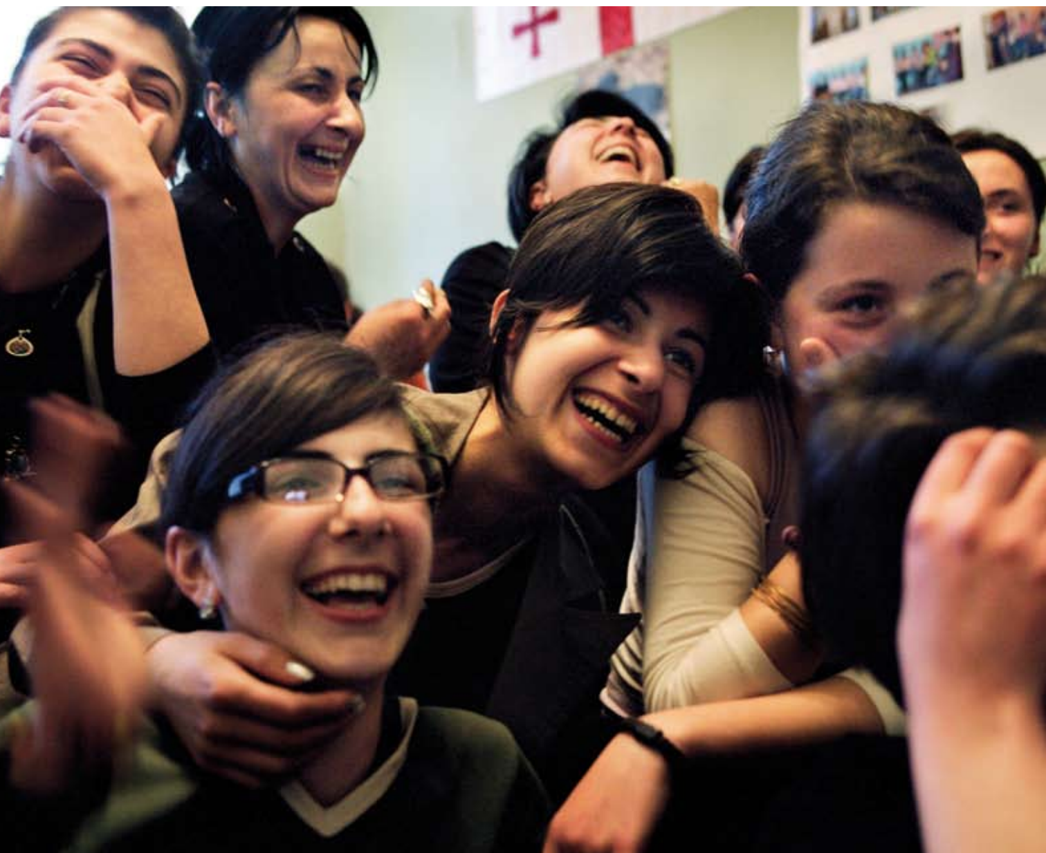
Young women from the organisation Imedi in Akhaltsikhe, Georgia.