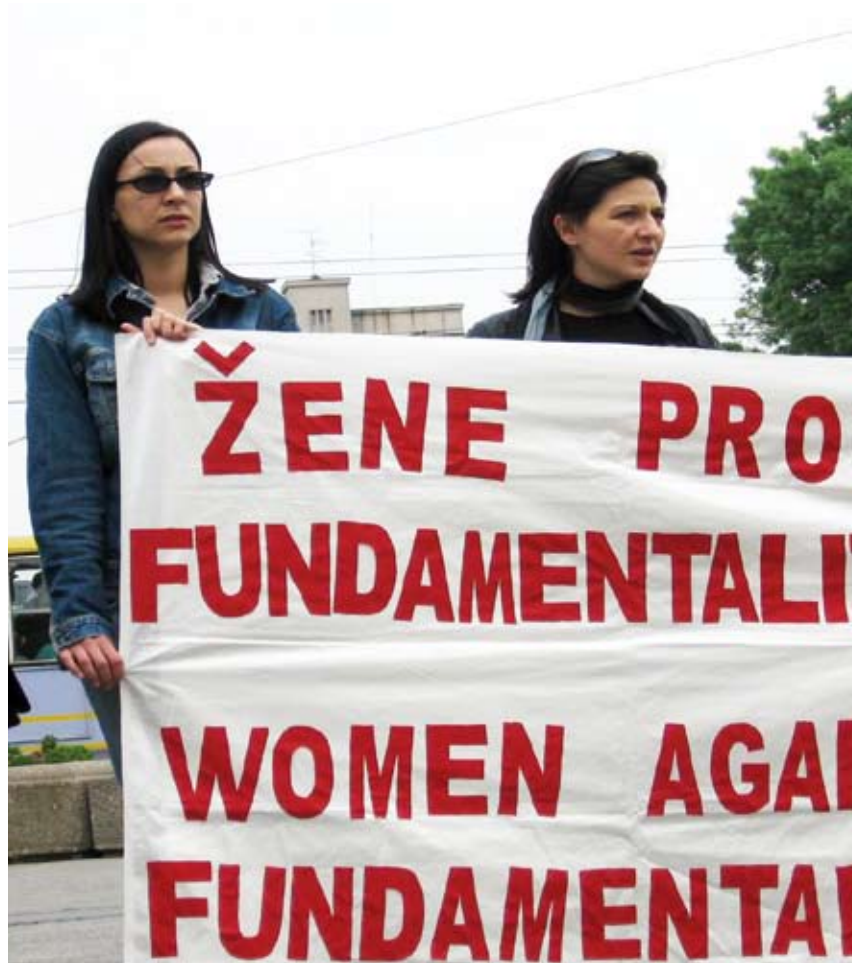
Women in Black demonstrate for peace.

Her activism started when she became a member of a high school theatre group called the Post-Pessimist. Through that group she was given the chance to travel throughout the Balkans and these experiences helped to promote her personal development.