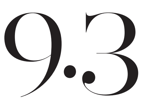
Maternity mortality per 100.000 live births in Armenia

Population of Azerbaijan in millions (The state of world population 2011, UNPFA)