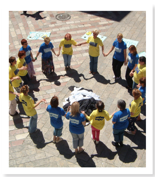
In Montenegro it is difficult for women to make their voices heard. But women's organisations are challenging the prevailing norms through different manifestations.