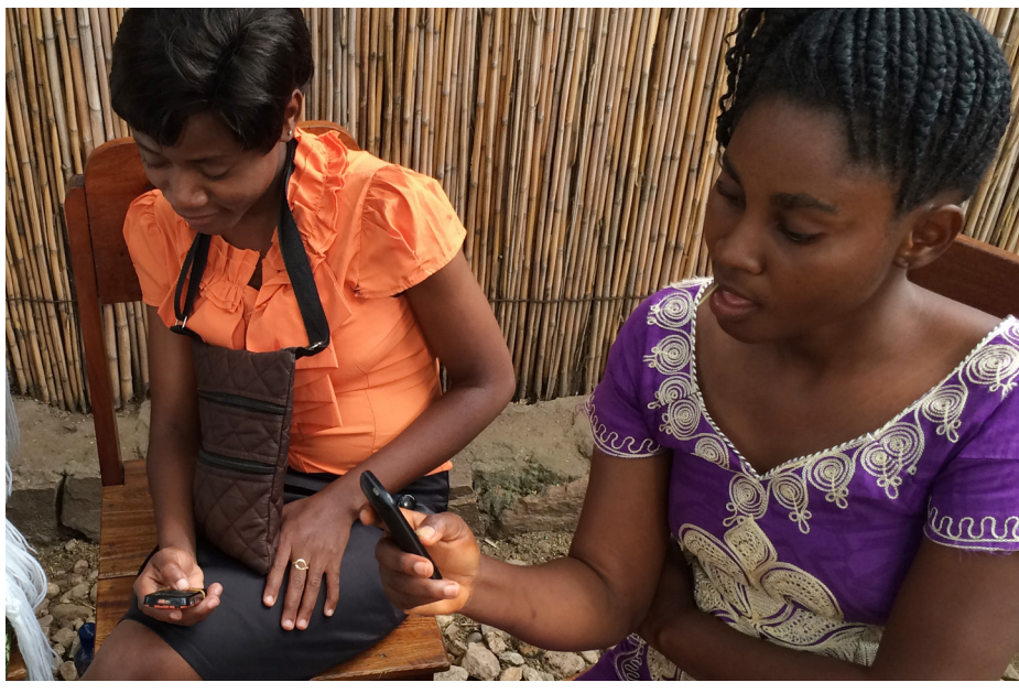
Connected and vulnerable. Threats are a daily reality for femdefenders in DR Congo.

In 2014, the Women in Black organisation was threatened and attacked on a number of occasions after calling for responsibility to be taken for the war crimes that were committed during the 1990s. In July, four activists were attacked in western Serbia when the organisation held a memorial ceremony to commemorate the Srebrenica massacre.