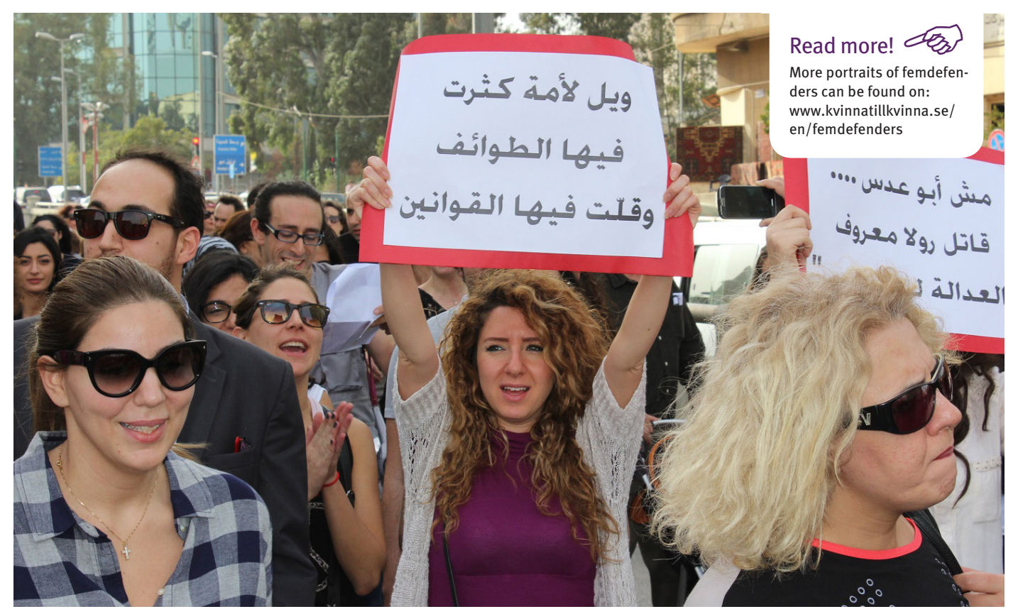
Femdefenders all over the world continue to fight for women's rights. The photo shows a demonstration to combat violence against women in Lebanon.

Association for Progressive Communications. 2013. "Statement to the 57th session of the CSW; Violence Against Women and Information and communications technology".